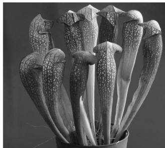
Small Pitcher Plant $6