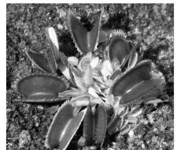
Venus Flytrap $15

Save 30% with our popular special: 1 each of all 4 plants above: $25